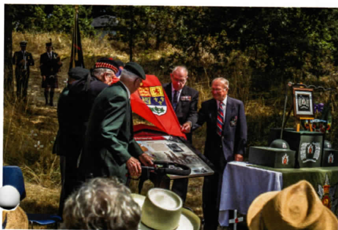
Falaise Gap sign was unveiled by Proud Veterans