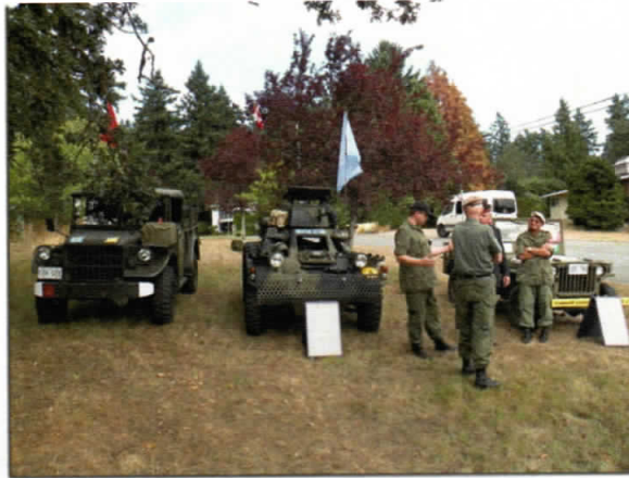
World War 2 vehicles courtesy of the Ashton Museum