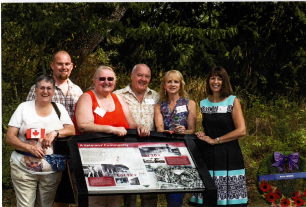
The Event Committee