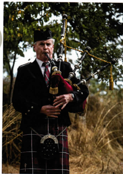
Our Piper was a great hit