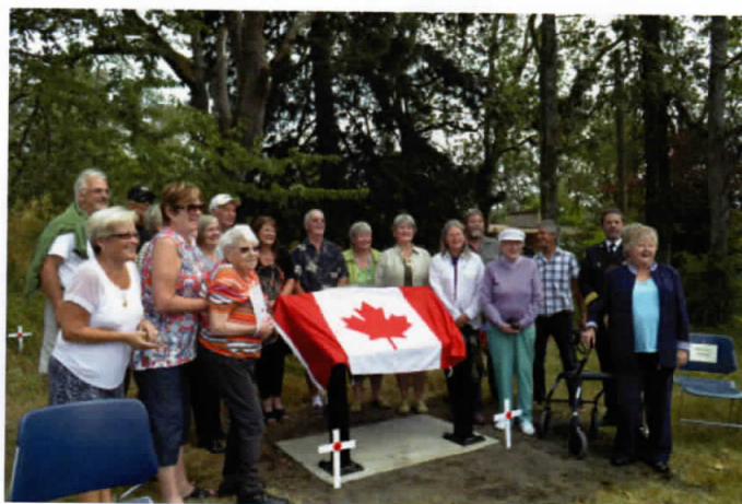
Many of the original residents helped with the Falaise sign