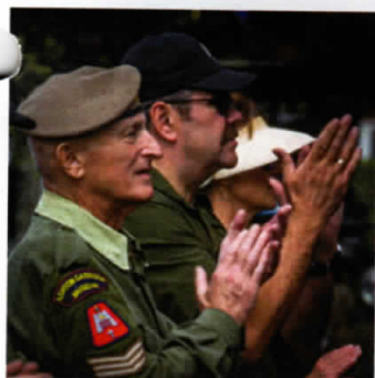
Guest from Ashton Museum