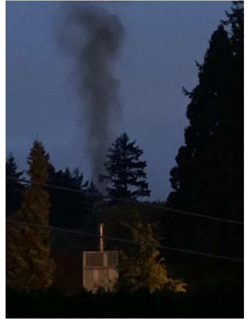
Crematorium emissions continue to be a concern