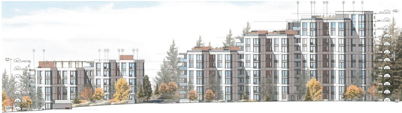
Proposed development on Elk Lake Dr. across from Adeline Pl.