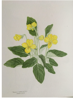
Yellow Montane violet