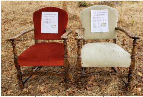
Mystery chairs that appeared in the park this summer