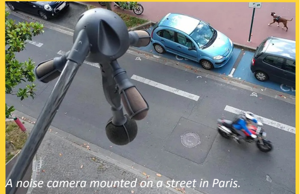
A noise camera mounted on a street in Paris.

the vehicle. They are already in use in Paris and are being considered in other jurisdictions as well. Teale is presenting a motion to Saanich Council to explore the possibility of setting up a noise camera pilot project. The Royal Oak on-ramp would be an excellent location for such a pilot.