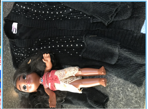
Two items left behind at the picnic. To claim, contact Stuart Macpherson.