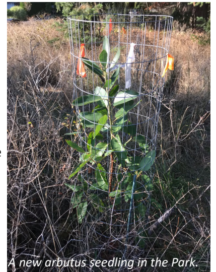
A new arbutus seedling in the Park.